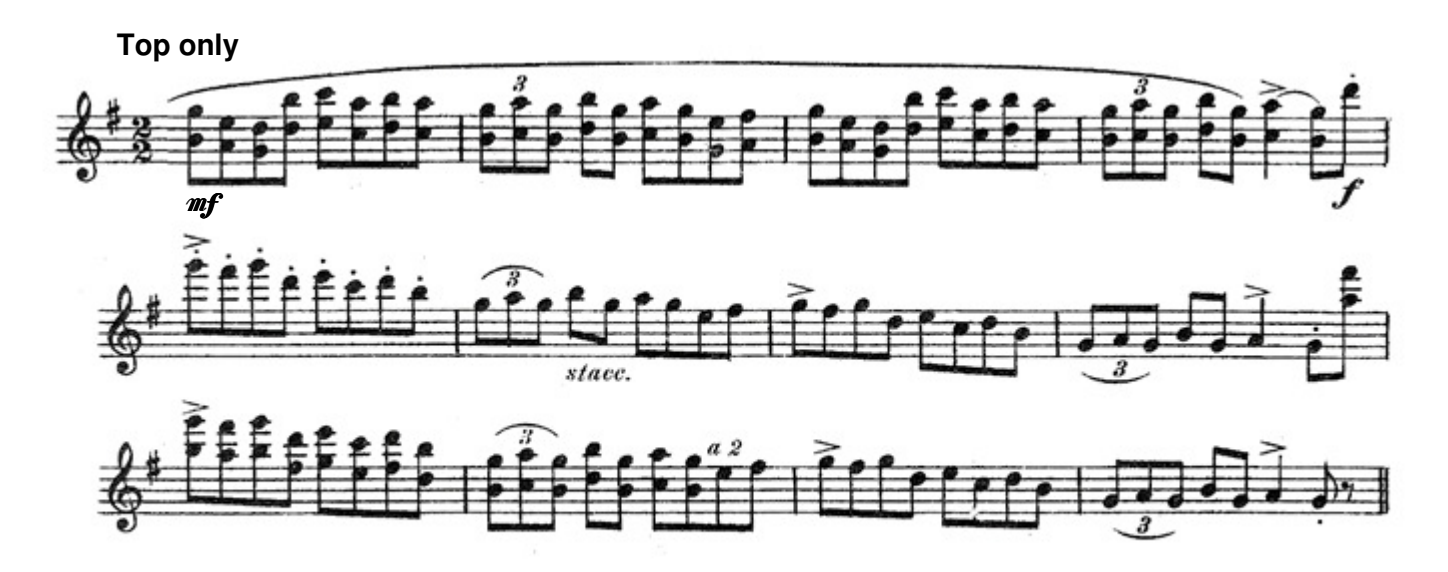
No. 3 Title: La Forza Del Destino - Verdi